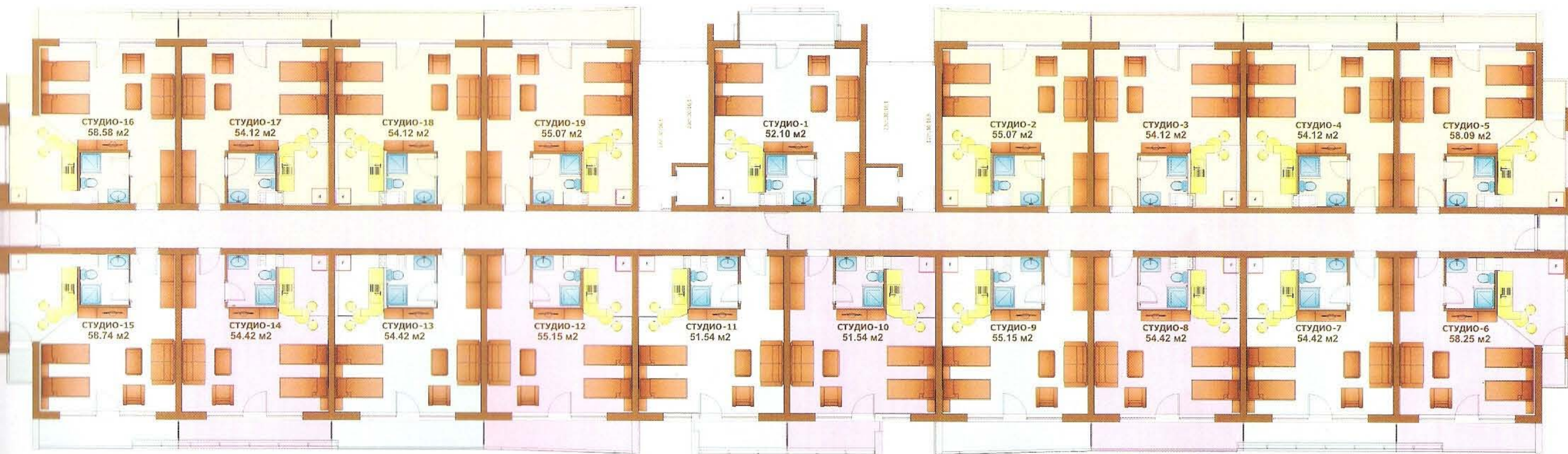
ПЛАН этажа +7,70 М 1:50